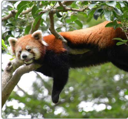
Sketch or paste an image of the endangered animal